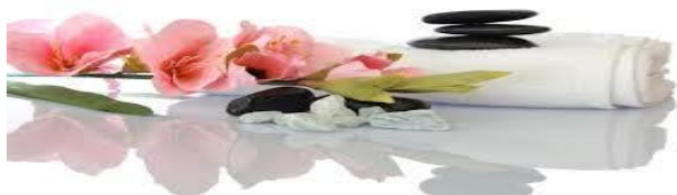
~ Facials are recommended every 4-6 weeks ~

Customized facial for ages 13-18. (45 min)